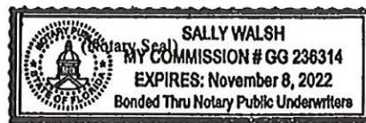
Notary Public Signature

Sworn and subscribed before me this 26 day of May , 20 21 at Port St. Lucie City Hall, in St. Lucie County, Florida.